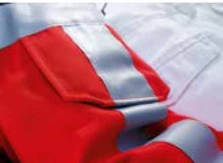
Programme package: Fire services Cleaning, disinfection and reproofing of protective clothing.