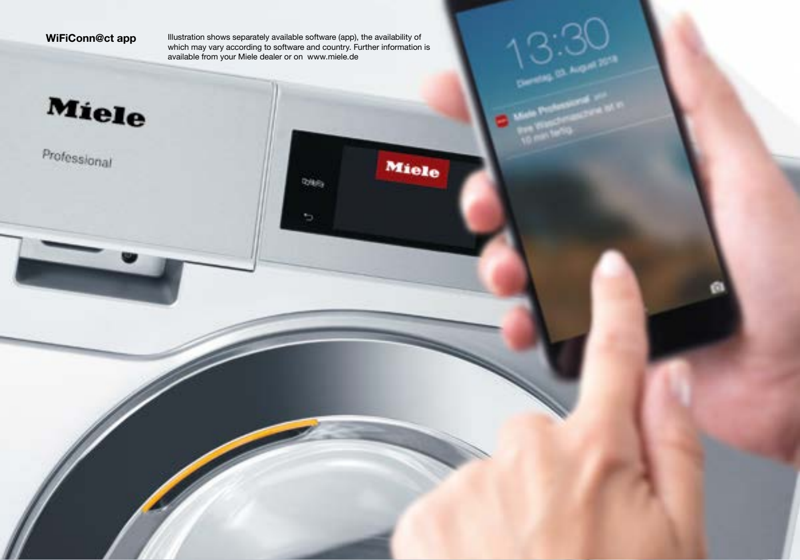
Illustration shows separately available software (app), the availability of which may vary according to software and country. Further information is available from your Miele dealer or on www.miele.de