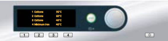
Direct-access mode: The user has access to 4 pre-set programmes via the direct-access buttons