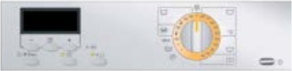
Washing machine: ProfilLine B Symbols controls

Machines from the OCTOPLUS series with their Profiline B Symbols controls offer uncompromising performance, allowing large volumes of textiles with everyday soiling to be washed. This helps users with large quantities of laundry to process to achieve excellent results in laundry care both fast and reliably.