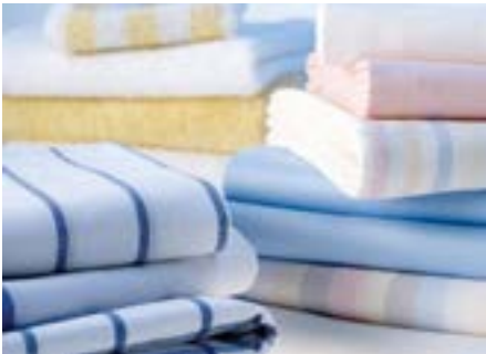
Programme package: Hotels Gentle cleaning of textiles for top-class hospitality.