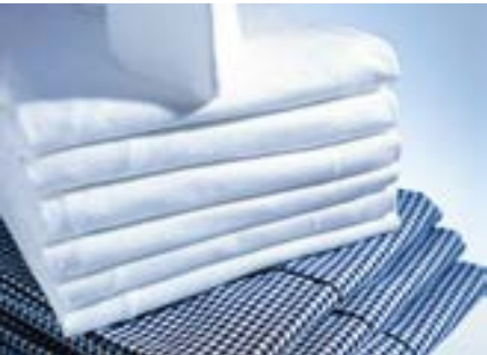
Programme package: Workwear Programmes with extended pre-wash and main wash as well as additional rinse cycles.