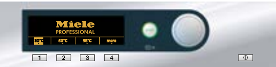
'Short-cut direct selection controls and more' mode The user has access to a total of 12 pre-set programmes via the direct-access buttons and the display