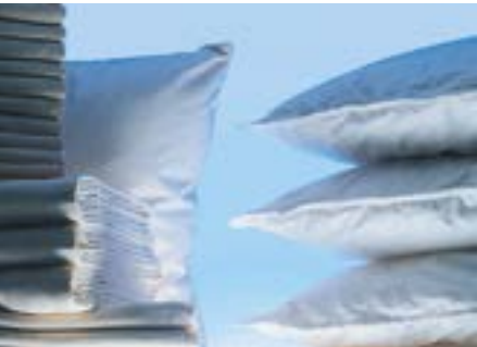
Programme package: Bedding Down duvets, synthetic and natural fibre bedding is gently cleaned and spun at the right speed.