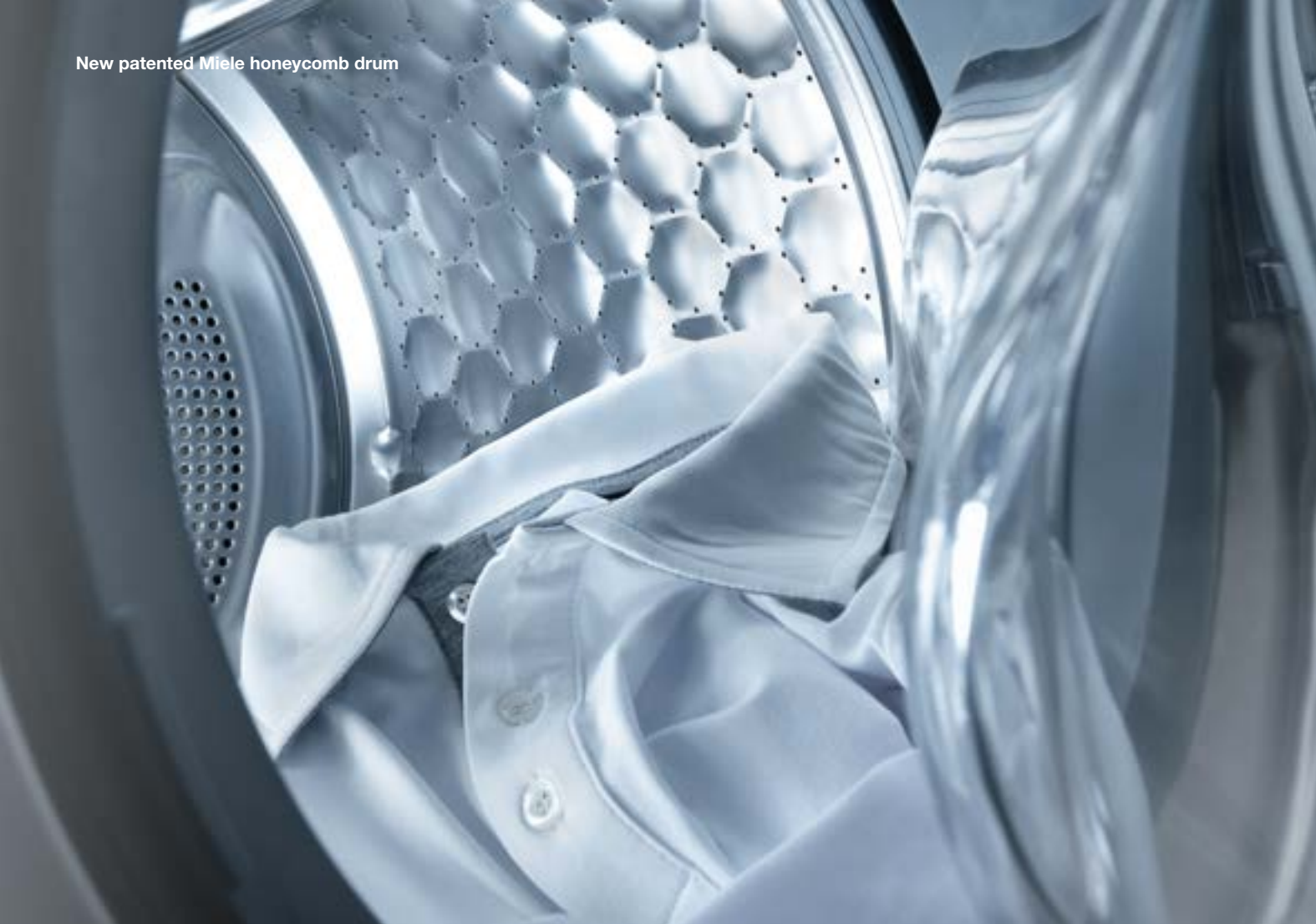
New patented Miele honeycomb drum