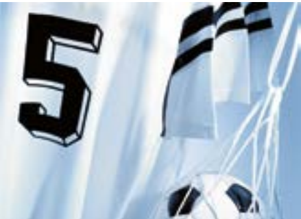
Programme package: Sport Sportswear made from polyester, polyamide and garments with breathable membranes are ready to wear again in next to no time.

Washing machines and tumble dryers from Miele Professional feature programmes and options to meet all needs. In addition to high-performance basic programmes, machines, depending on the model, are equipped with a large number of special-purpose programme ex works for washing and drying a variety of textiles.