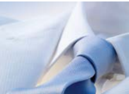
Programme package: WetCare Gentle cleaning of outerwear with the "WetCare" symbol and textiles made from sensitive fibres.