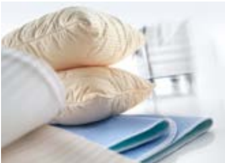
Programme package: Disinfection Safe cleaning of contaminated textiles in thermal and chemo-thermal disinfection programmes.