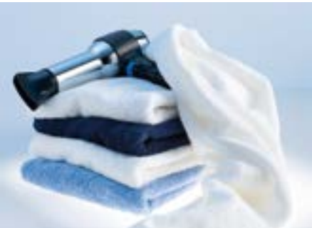
Programme package: Spas/Hairdressers Thorough removal of hairs and cosmetics from textiles.