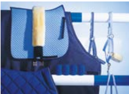
Programme package: Equestrian Cleaning of heavily soiled textiles as well as items with lots of fluff and hairs and voluminous horse blankets.