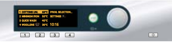
Standard mode: User has access to all standard and application-specific programmes

The flexible user interface on Profitronic L Vario controls also allows access to programmes to be customised to the needs of a variety of user groups.